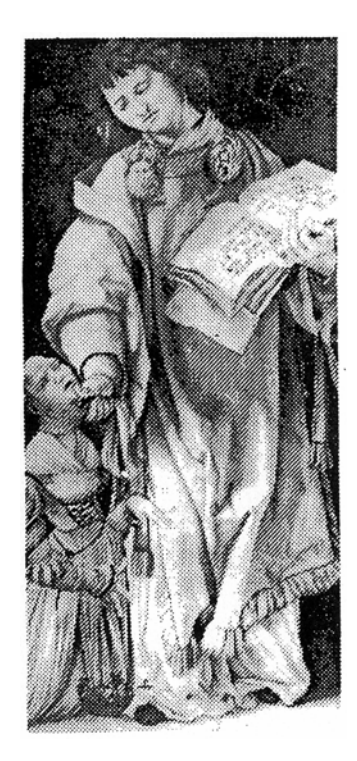
Illustration 1-Girl Being Exorcised. In the context of the Huguenot Wars, Jeanne's exorcists aimed to justify the rituals of Catholicism by proving them efficacious against her multiple severe symptoms.

These historical materials suggest that core features of DID represent a stable diagnostic cluster through time.